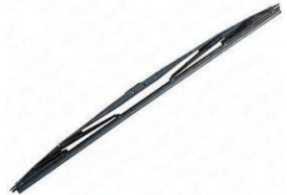
Windshield Wiper Blade

If not replaced, worn out wiper blades can cause restricted visibility and permanent damage to the windshield.