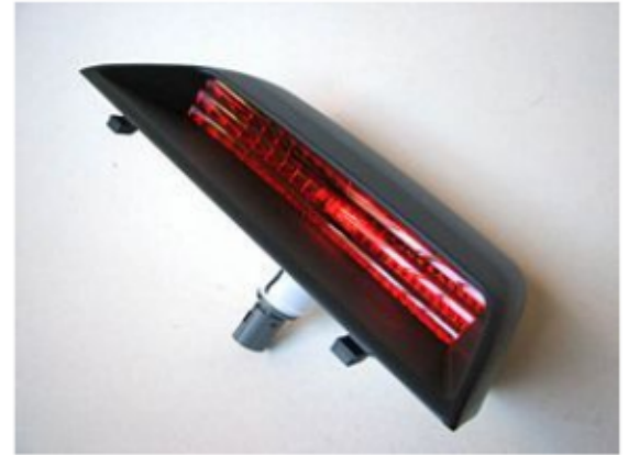
Third Brake Light Assembly