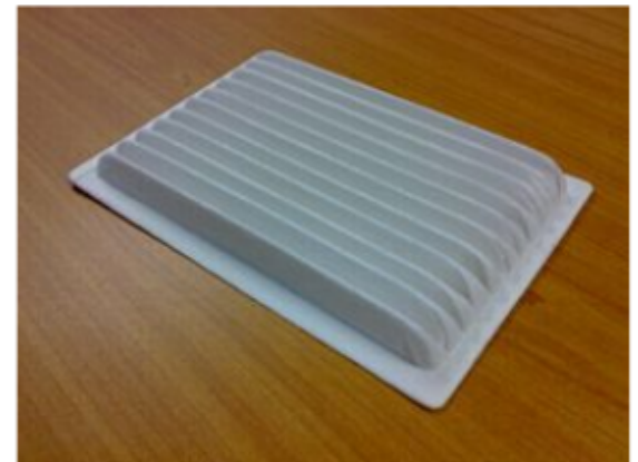
Cabin Air Filter

If not replaced, the air conditioning system will develop an odd odor. The air conditioning filter, also known as the cabin filter, removes dust and pollen from entering the car cabin.