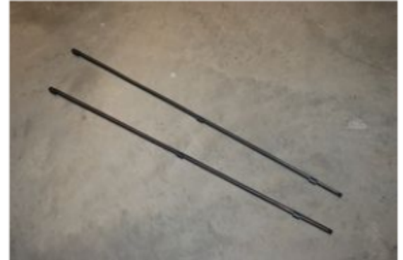
Windshield Wiper Inserts

If not replaced, worn out wiper blades can cause restricted visibility and permanent damage to the windshield.